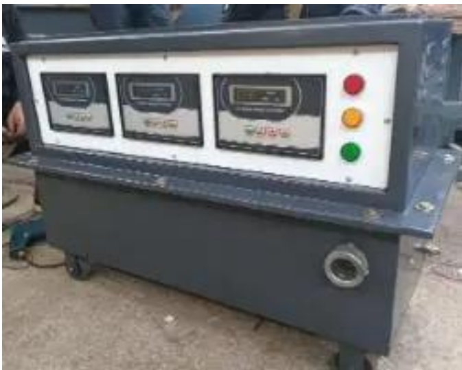
Oil Cooled Three Phase