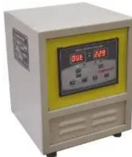
Digital Servo Single Phase