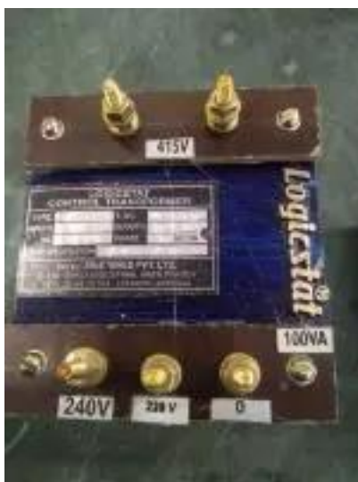
Control Transformer Single Phase