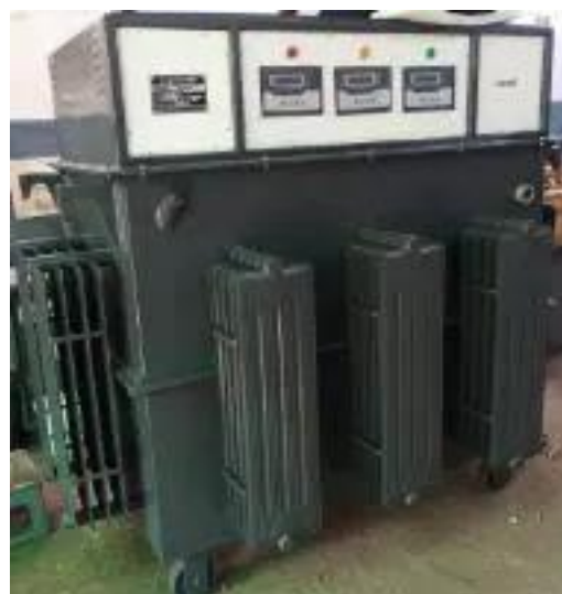
Digital Oil Cooled Three Phase