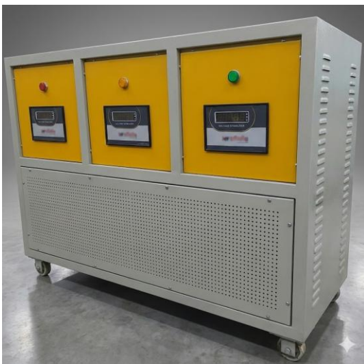
Digital Servo multiple Phase